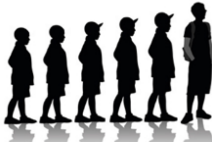
Y1 Y2 Y3 Y4 Y5 Y6

In addition to IEYC, Invictus Kindergarten uses a HK-based Chinese Language Curriculum (traditional character), an adapted Early Years Foundation Stage programme for our English, and the Singapore Ministry of Education Mathematics Framework, a comprehensive and world-renowned programme.