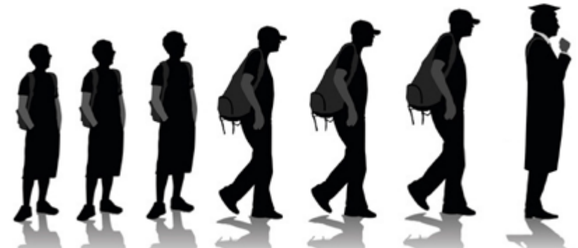
Y7 Y8 Y9 Y10 Y11 Y12 Y13

In the primary years (Y1-Y6) students are immersed in a bilingual programme using English and Chinese (traditional written characters). The programme utilises modern and innovative teaching methods to develop skills and knowledge in curricular areas, as well as to develop personal growth in areas such as resilience, collaboration, and international mindedness. The Chinese language programme is adapted and based upon the HK Chinese Language Curriculum and the Mathematics programme uses the Singapore Mathematics Framework. For English and other subject areas, the International Primary Curriculum (IPC) provides a broad and holistic curriculum, complemented, by the Cambridge Primary programme, to ensure that all teaching and learning at Invictus is tailored to the needs of our students.